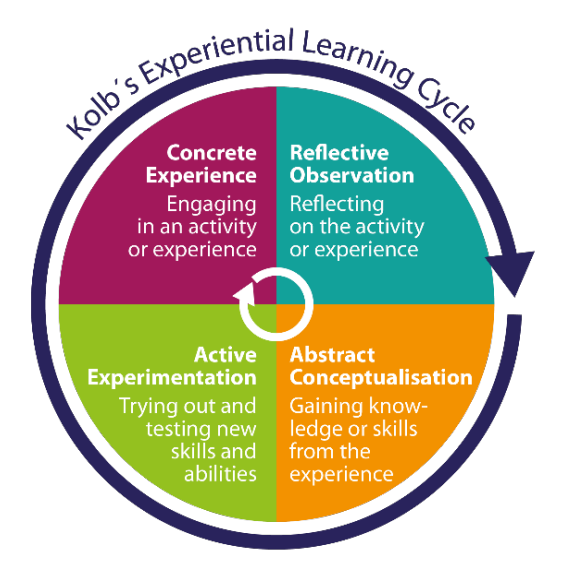
Figure 2. Kolb's experiential learning cycle

Due to the emphasis on one's own experience, the theory of David Kolb – leading advocate and promoter of the practice of experiential learning – was chosen as the basis of the pedagogical framework. Kolb's theory can be seen as an important approach to how counsellors learn. Kolb (1984) assumes that experiential learning follows a cycle of four steps.