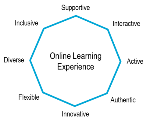
Figure 11. The eight principles that define TU Delft's Online Learning Experience

The Online Learning Experience (OLE) is a student-centred, online learning model that holds eight interrelated principles, which define TU Delft's online courses.