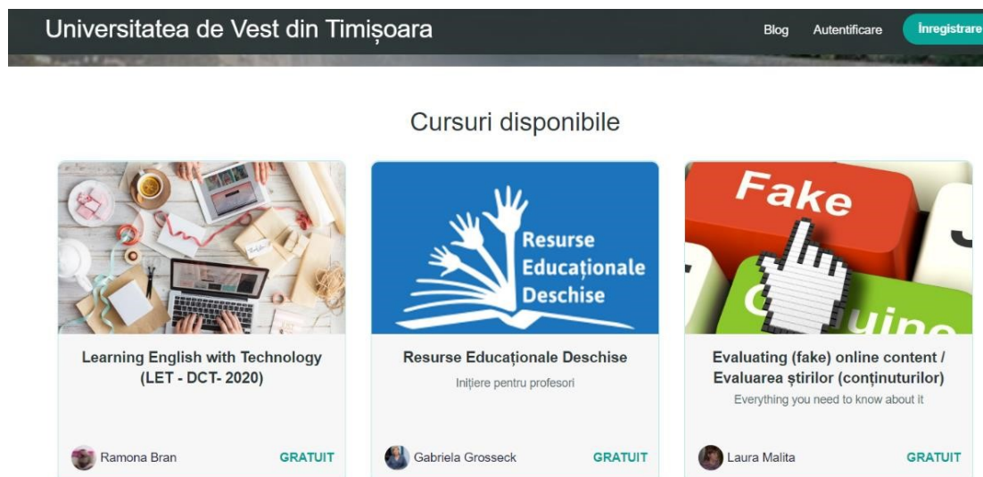
Figure 2. MOOCs offered by WUT

For the purpose to find the best ways to interact with students and provide quality online education, WUT has consistently applied questionnaires to both students and teachers. Moreover, WUT is the first higher education institution that organizes an online postgraduate program for training and continuous professional development of pre-university teachers, focused on digital and online teaching, learning and assessment activities.